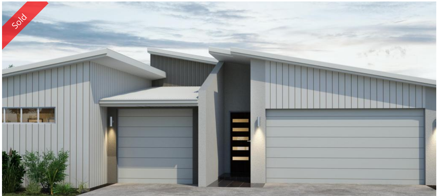
Lot 92 Lemon Myrtle Place, Woombye