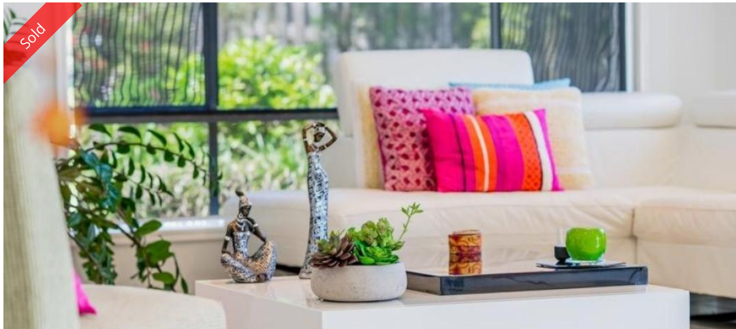
16 Innovation Place, Nambour